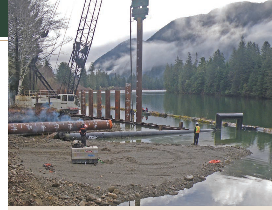
To prevent damage from debris flow damaging the central wharf in the remote BC community of Wuikinuxv (Wi-kin-oo) Nation, engineers rebuilt a debris barrier and wharf facility.

The community's wharf, which the locals rely heavily on, was badly damaged by debris flows that travelled down steep slopes into the lake and river, dumping large trees and other objects into the watershed.