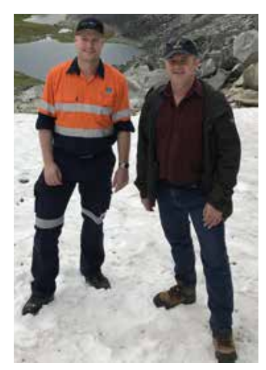
In the field in Yukon, Canada, with CSA

Finally, he points out, the tie-in can aid with periodic independent audits and health checks to ensure processes are being followed, risks are being monitored and dealt with, ►