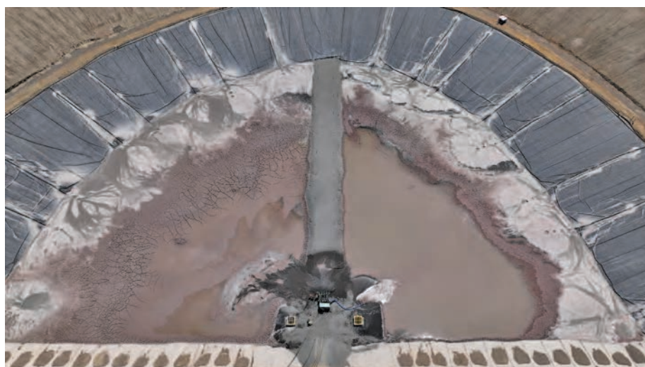
Hydraulic Dewatered Stacking (HDS) at Anglo American's EL Soldado operation in Chile

Conventionally deposited tailings contain a large amount of entrained water with supernatant water typically managed on the surface. This results in large amounts of water being lost through entrainment and evaporation: water losses from tailings are in fact the most