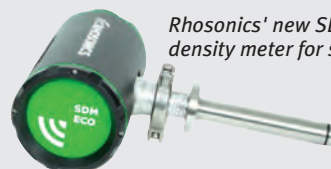
Rhosonics' new SDM ECO non-nuclear density meter for slurries