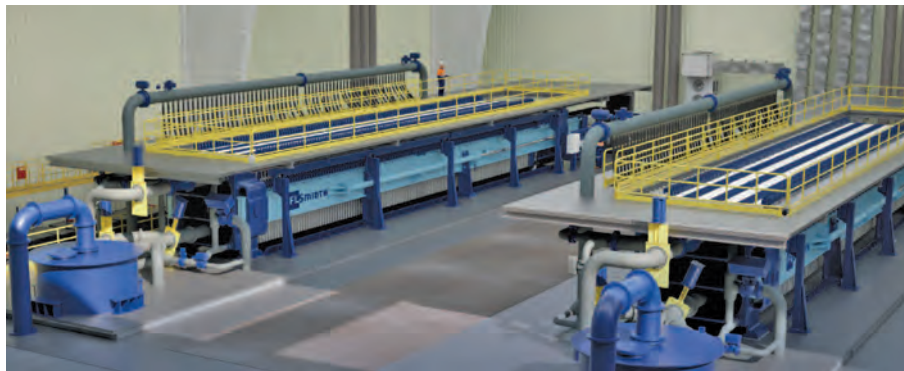
FLSmidth has been seeing market success with its new AFP2525 filter with which it says customers can expect an average of 93% availability and up to 95% recovery of process water. AFP2525 filters for Buenaventura's San Gabriel are expected to be delivered by the end of July. Installation and commissioning will be in Q3 and Q4. Additional filters for Torex's Media Luna are scheduled for shipment in April with installation and commissioning also occurring in Q3 and Q4

The authors state: “Typical methods of improving the raking capacity involve using deeper and longer blades to move more material and cover more area. In looking at the raking capacity for the Kazakhstan DCTs, it became apparent that something else was needed to produce the results the customer was looking for.