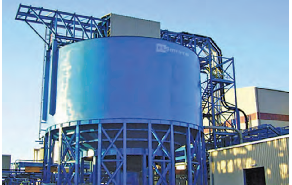
An FLS Deep Cone Thickener

The authors state: "Development of higher underflow densities from thickeners has long been a goal of thickener designers. The factors that limit the underflow density are the mud retention time and the raking capacity. At higher underflow densities the mud develops a yield