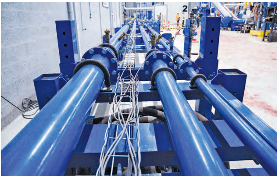
Pipe loop test area at the Weir Technology Hub in Venlo, Netherlands

pumps or centrifugal pumps depending on the dewatering performance of the thickener. Weir then weighs up the trade-offs – including operational fluctuations – to establish a risk profile and assess both the capital and operational costs.”